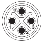
Connector pin assignment of M12 plug, 4-pos., S-coded, view of pin side